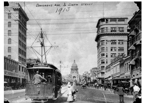
Congress Avenue and 6th Street, 1913 C02001

Contemporary Austin can discover more than just the design of her development along the rails of the streetcars. Issues that may seem as modern as conflict with rideshare companies, electric light rail, mobility and transportation can find their origins in the story of the streetcars. In some cases they may even discover striking similarities to events that happened nearly 100 years previously, such as when the streetcars went to war with the Jitneys in 1915. The prospect of an electric light rail might seem like a modern concern, but the story of the streetcar proves otherwise. It is a story that demonstrates how such mass transit was once employed in the City and the way that its network integrated it into the fabric of Austin. http://library.austintexas.gov/ahc/rails-528828