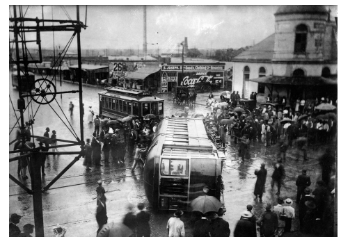
Streetcar on its side at Congress and 3rd, September 25, 1913 C00598