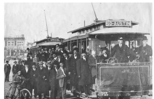
First Streetcar crossing Congress Avenue Bridge, December 2, 1910 PICA 06815