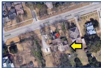
The building is located behind Texas Open Door Realty. Please park along E. Main St.