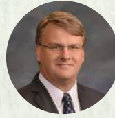
Director 2 Year